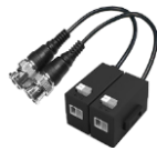
PFM800-E Passive HDCVI Balun